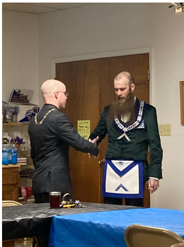
NM Demolay serving dinner and visiting our lodge.