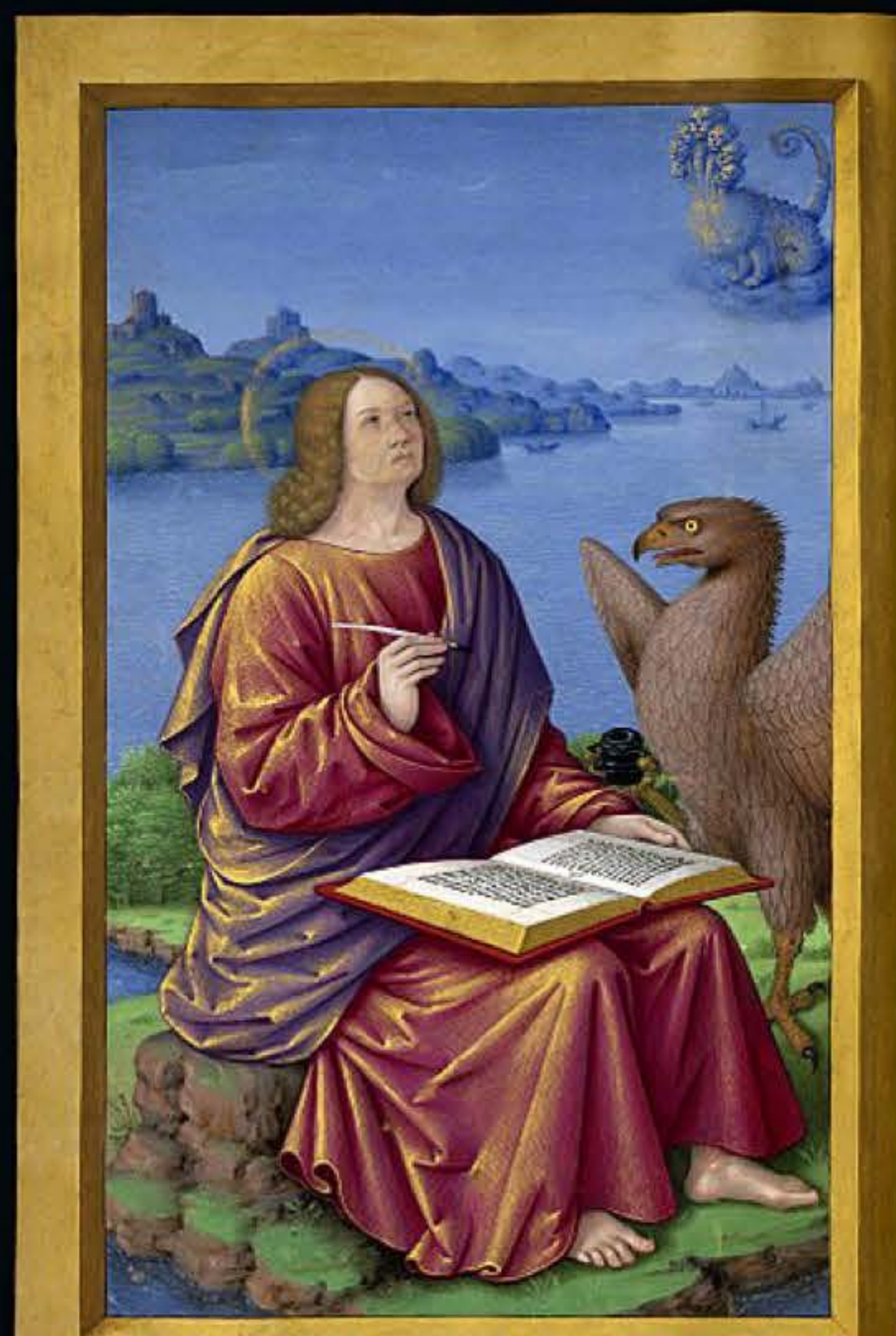
St. John the Evangelist